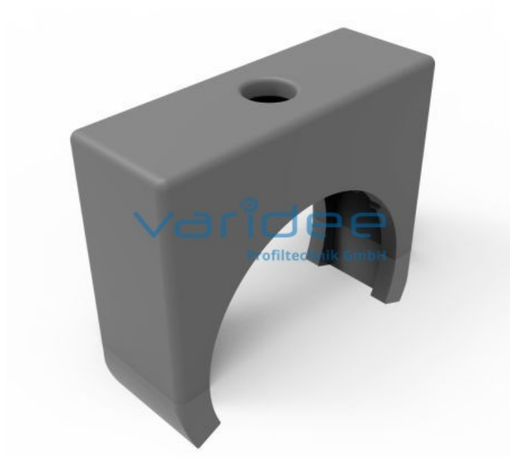
Tube clamp D30, grey